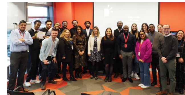
Breakthrough graduation London event

Prison leavers who are employed are half as likely to reoffend as their unemployed peers but unfortunately only 16% of leavers are employed within 12 months of release. CGI has partnered with Breakthrough, a social enterprise which provides a pre-apprenticeship programme for prison leavers and those at risk of entering the criminal justice system. The Breakthrough eight-week programme is built to equip their associates to succeed in a long-term stable career within technology and digital industries. As part of the curriculum Breakthrough looks for industry experts to deliver some of the sessions. CGI plays an important