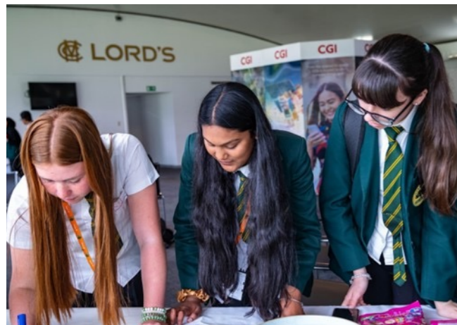
"Students at Young Dreamers in June 2022"

Our journey so far has involved over 1,400 students, supported by over 100 volunteers in two different UK locations. Students enjoyed the entire process and cited a range of skills where they felt they had progressed, including teamwork, communication, listening and presenting.